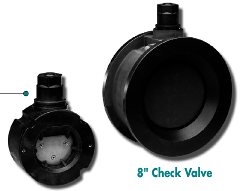
3" Check Valve